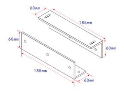
Magnetic lock Z-type bracket (500kg)